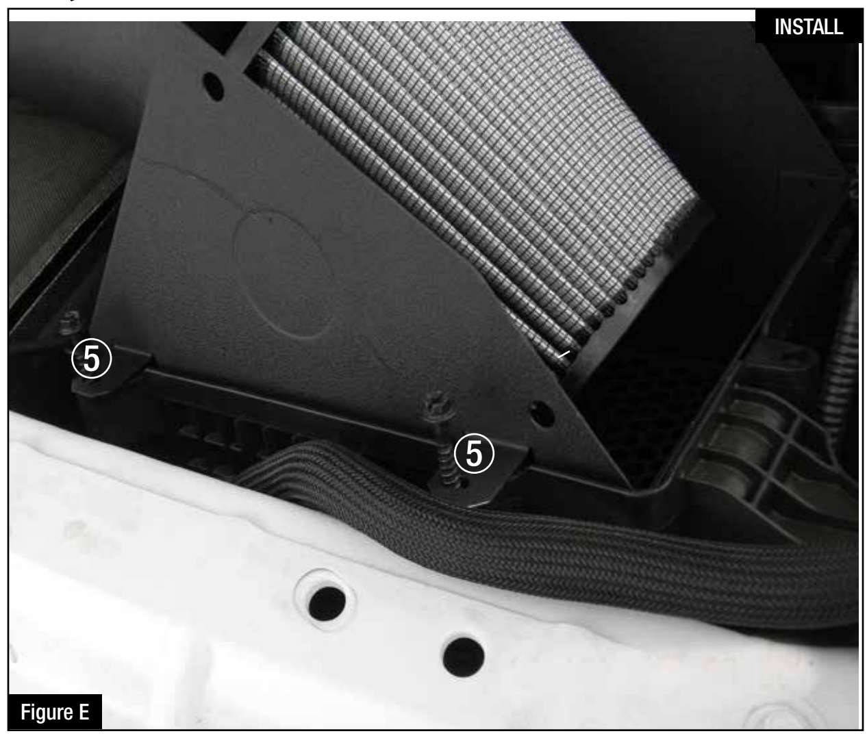
Refer to Figure E for Step 6

Step 6: Drop housing and tube assembly into place and fasten housing with the two original screws 5.