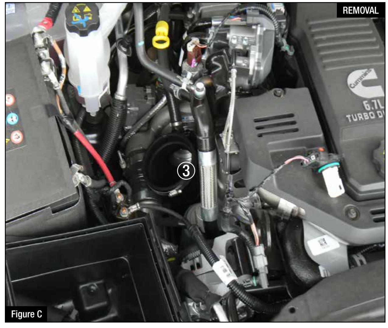
Refer to Figure C for Step 4