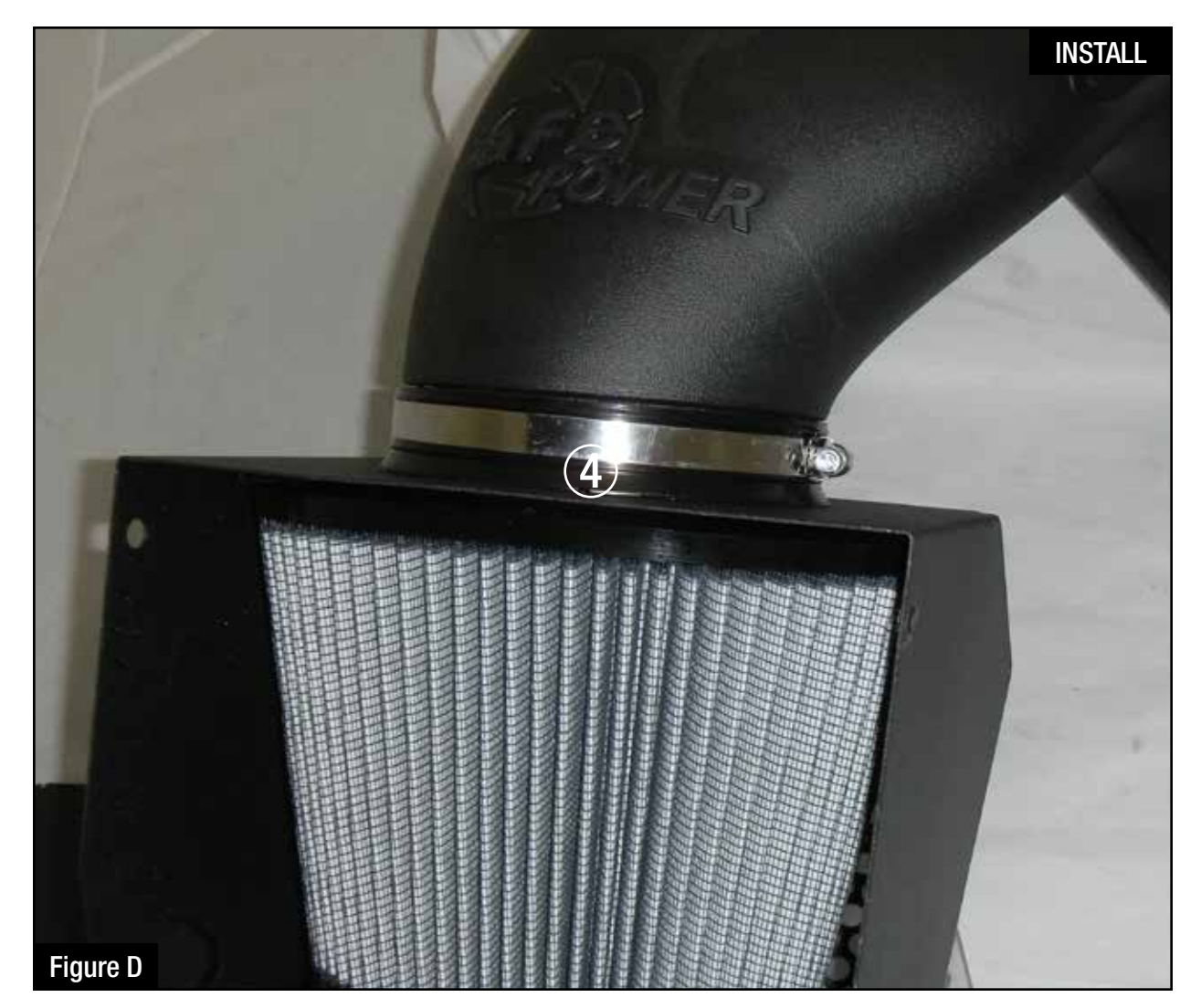
Refer to Figure D for Step 5