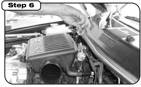
Loosen clamp at throttle body and remove resonator box.