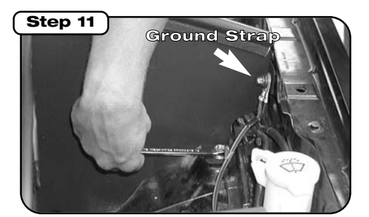
Use ground strap hardware for inner fender for mounting.