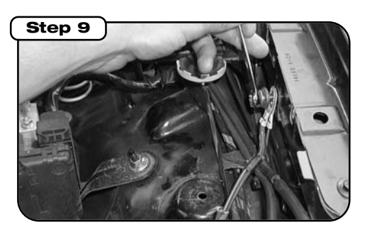
Remove ground strap at inner driver-side fenderwell. (Keep bolt for installing filter housing.)