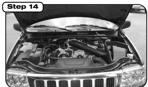
Place enclosed CARB EO sticker on a clean/smooth surface on or near the intake system. EO identification label is required in passing Smog Check inspection. Make sure all hoses and clamps are tight and that all electrical components are secure. Re-check after a few hours of operation.