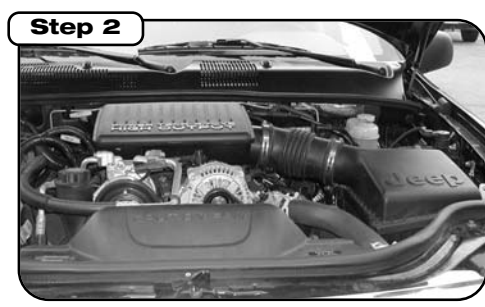
Complete stock intake.