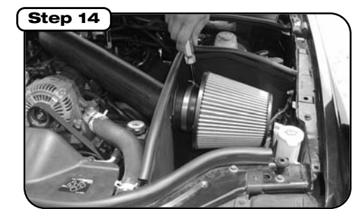
Install filter to intake tube and tighten clamp.