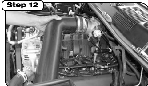
Thread filter end of housing through opening in filter housing first, then slip coupler over throttle body. Tighten clamps at throttle body.