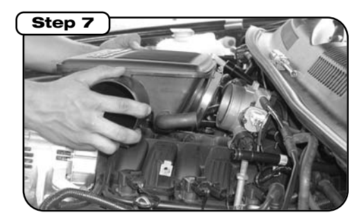
Loosen clamp at throttle body and remove resonator box from throttle body.