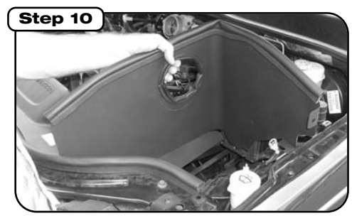
Before installing housing, apply large trim seal to top of housing and small trim seal to tube inlet. Install filter housing using supplied hardware on lower mounts.