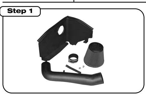
Complete kit with parts.