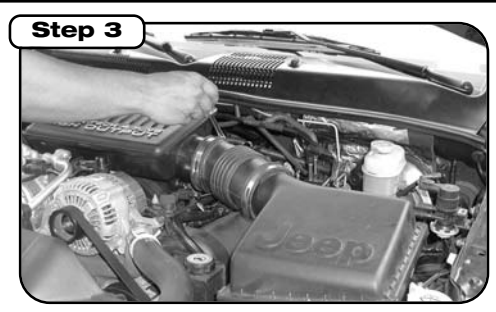
Loosen clamp at air resonator box and remove top half of filter box.