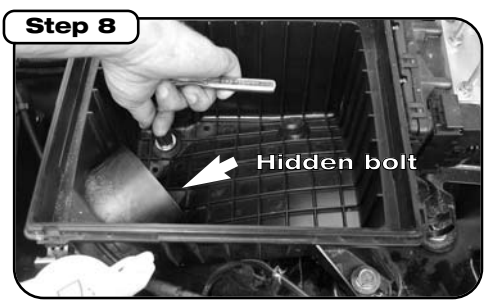
Remove four bolts from lower half of air box. Note: There's a bolt hidden underneath airbox inlet tube. You must use an open end wrench or adjustable wrench to remove.