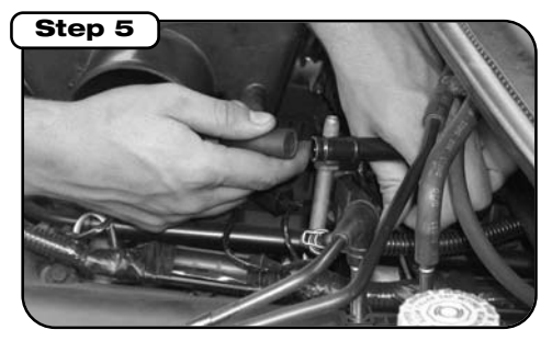
Remove vent hose at tubing coupler.