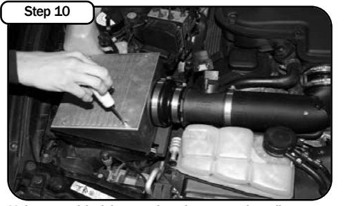
Using provided button head screws install covers with the aFe logo facing the front of the vehicle.