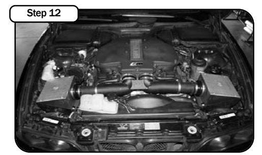
Your installation is now complete. Make sure you tighten all clamps and check all electrical connections. Re check periodically.