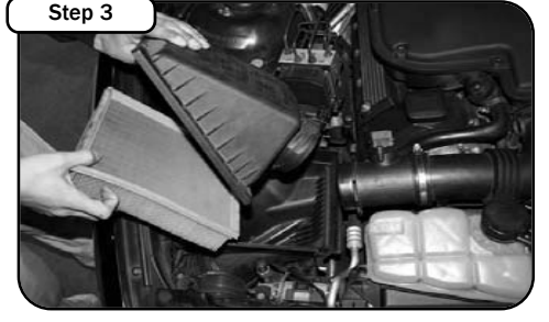
Remove clips from the mass air sensor and the air boxes and remove top half of air boxes and filters.