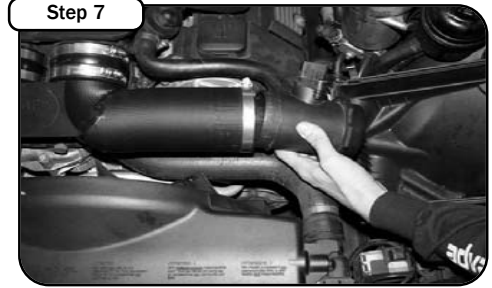
Install mass air sensors into the tube by pressing the sensor onto the tube. Tighten down provided #52 clamps.