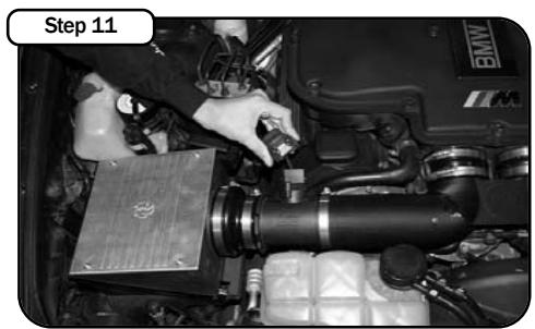
Re-connect both mass air sensor plugs.