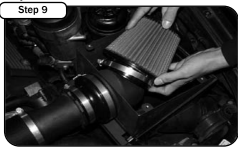
Install 2 provided High Flow aFe filters and tighten clamps.