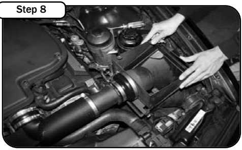
Install both air boxes using reducer couplers. Attach factory clips to secure to the air box and tighten clamps at coupler.