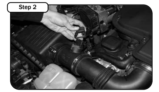
Unplug both Mass air sensor plugs from sensors.