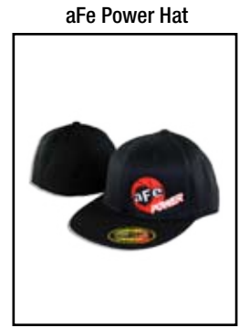
P/N: 40-10114 S/M P/N: 40-10115 L/XL

To purchase any of the items above, view airflow charts, dyno graphs, photos, and video; please go to aFepower.com.