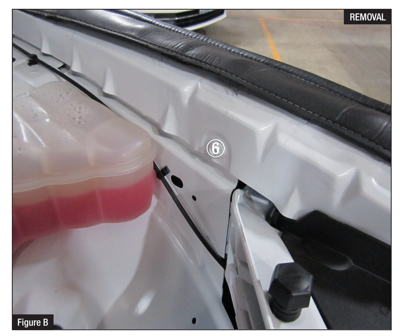
Refer to Figure B for steps 6-7

Step 6: Remove the 10mm bolt from the fender side 6.