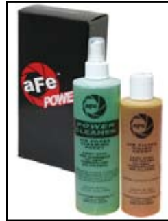
Gold Squeeze Restore Kit