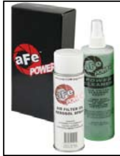
Gold Aerosol Restore Kit