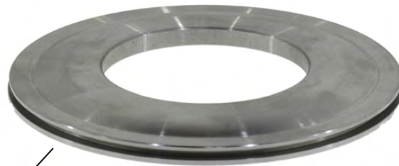
New Billet Steel Replacement Upper Primary Pulley Piston