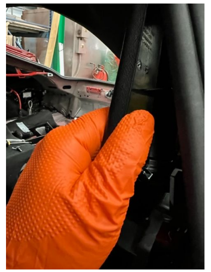
Then move to the B-Pillar top trim and remove them by pulling them off carefully, they just pop out.