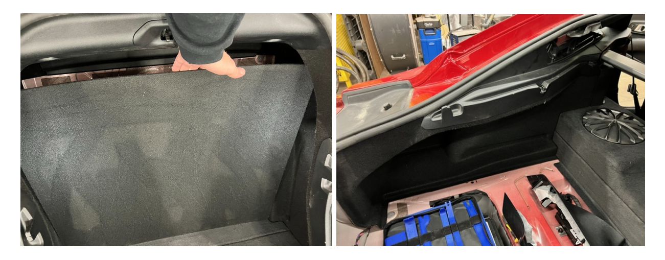
Now remove the rear trunk panel (two T30 torx screws as well as two push pins)

Use the power or manual lever to move the seats all the way forward. Next remove the cargo cover and bottom panel of the trunk area.