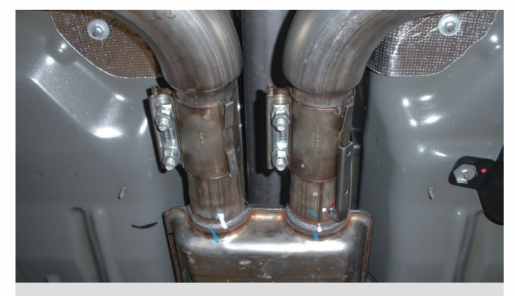
Detail 32 - Factory Connect