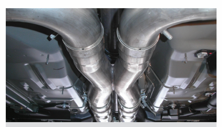
Detail 32 - Performance Connect