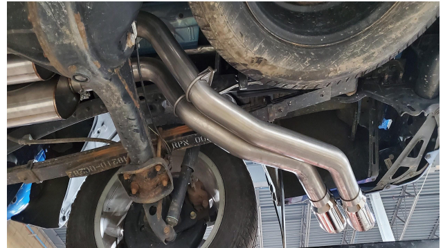
Detail 11: Tailpipes with hanger bracket.

After double checking for clearance and making sure all lines, wires and hoses are secured, drive the truck for 10-20 miles and re-check all clamps and clearances. Your system may be tack welded at the joints/ clamps to reduce shifting of the system during heating and cooling cycles. Make certain to disconnect the battery before performing any welding.