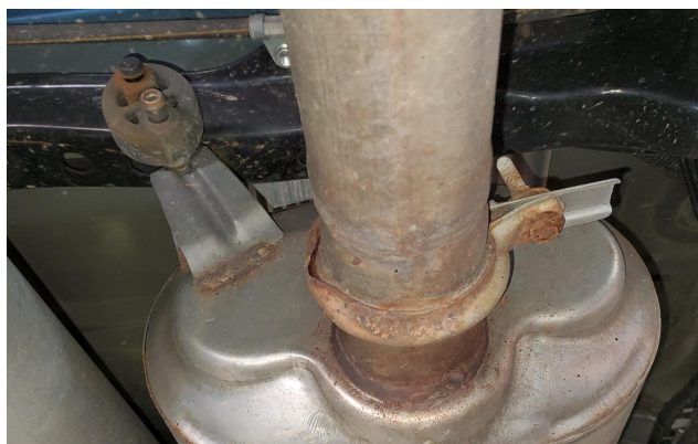
Detail 3: Rear OEM tailpipe connection