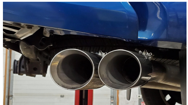
Detail 12: Tips installed.