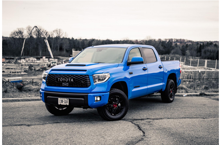
2019+ Toyota Tundra TRD Pro CrewMax SR5 (TOYT14XXX)

Thanks for purchasing a Stainless Works catback exhaust system for your 2014+ Toyota Tundra. Our team has worked to ensure that this product is the premium in performance, quality, and fitment. We are proud to say that this system will unleash the true character of your vehicle. We encourage you to read through the following steps, and check the included Bill of Materials before beginning. Please follow these steps to ensure that your installation goes as planned.