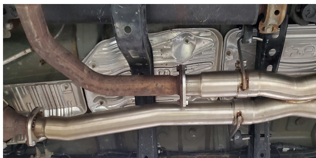
Detail 7/8: Factory connection; X pipe & hanger clamps shown