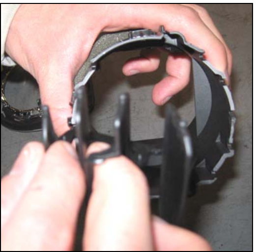
NOTE : Retain the components shown below. These can be reinstalled should the customer decide to return their inner vent assembly to "stock".