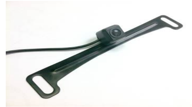
License Plate Bracket

Determine which of the two supplied camera mounting methods you prefer.