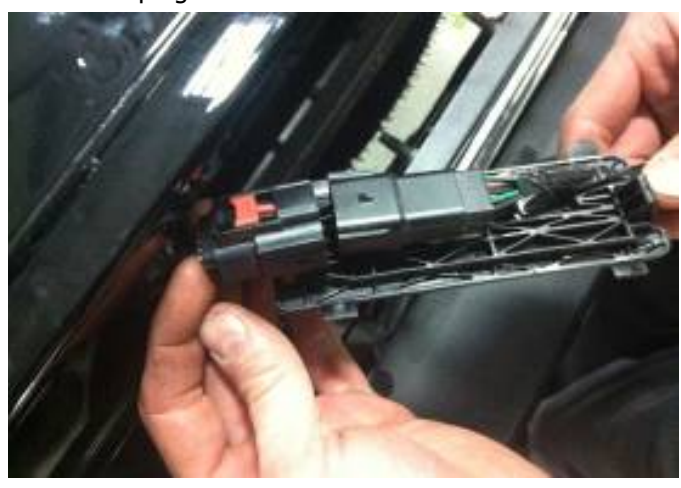
Step 3: Run the new camera harness through the opening in the back of the bed to the underside of the vehicle.