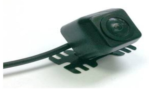
Alternate Camera Mount Bracket

Place camera in desired position to confirm fitment (Note: Some states prohibit items blocking the license plate; check local authorities to confirm legal status for your application).