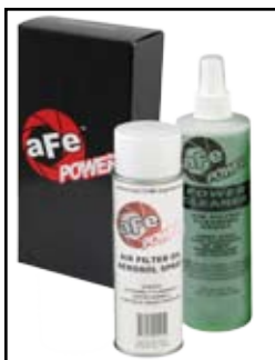
Blue Aerosol Restore Kit