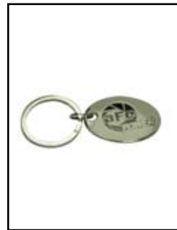
aFe Key Chain