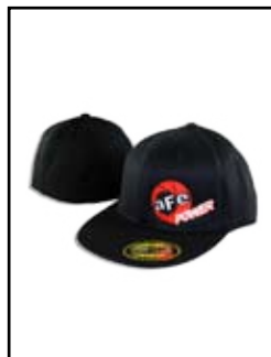
aFe Power Hat