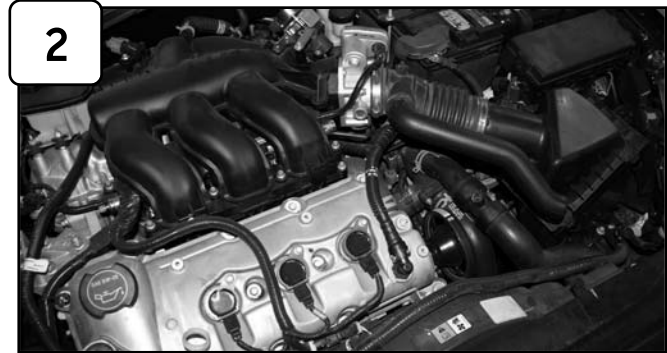
Complete Stock intake. Please disconnect battery terminals before installation.