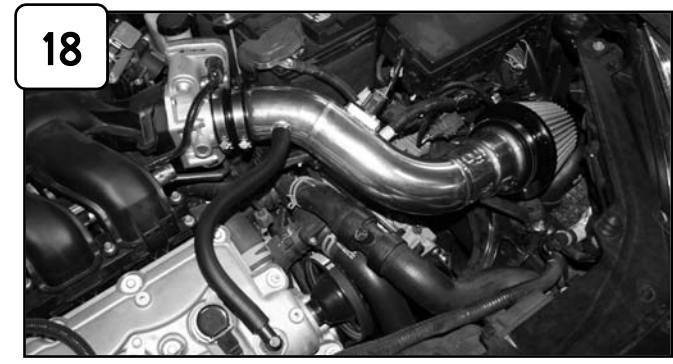
The installation of your Takeda performance intake is now complete. Please check all components and retighten if necessary. Thank you for choosing Takeda!