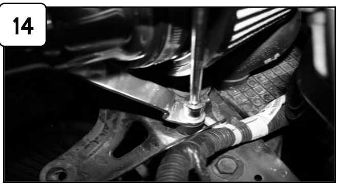
Using provided flat washer and nut, secure tab using 13mm socket or wrench.