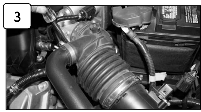
With 5/16" nut driver loosen clamp on throttle body. Disconnect MAF sensor harness.