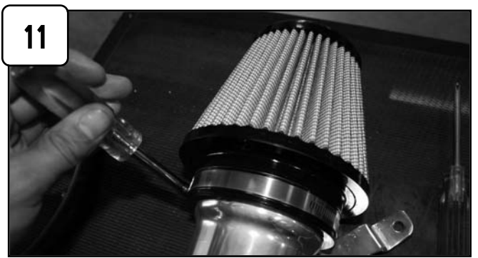
Attach air filter and tighten using 5/16" nut driver.