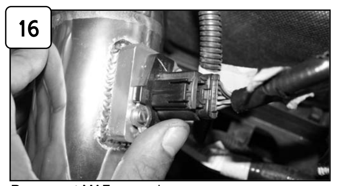
Re-connect MAF sensor harness.