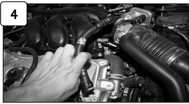
Remove crank case line.