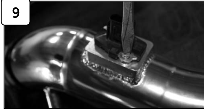
With provided M4 screws, install MAF sensor to new intake tube.