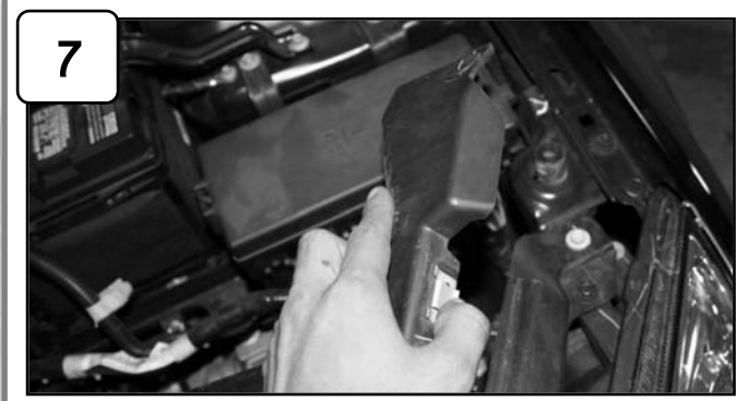
Remove plastic cover.