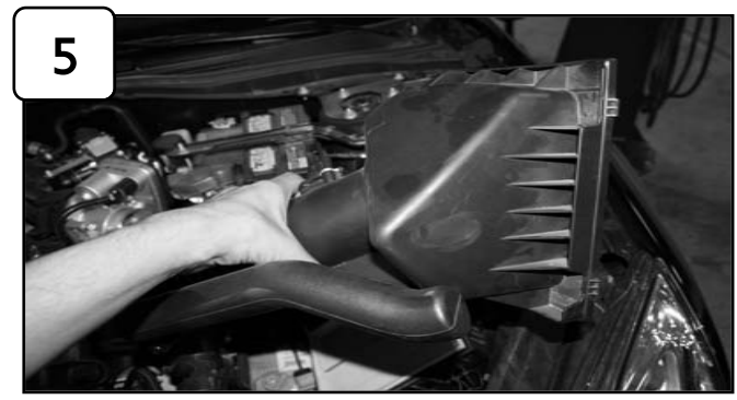
Remove upper half of air box and stock tube assembly.