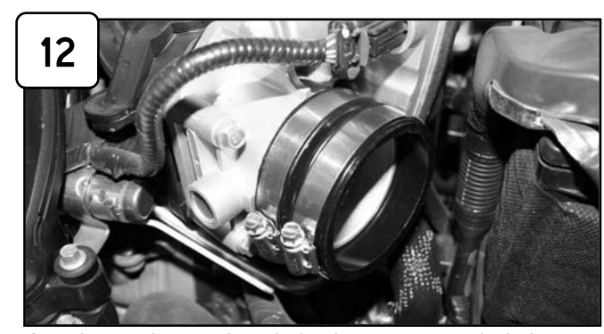
Attach coupling to throttle body using provided clamps. Do not tighten.