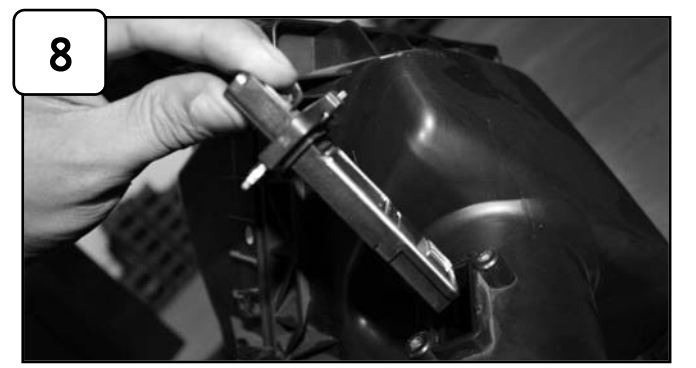
Remove MAF sensor using phillips screwdriver.