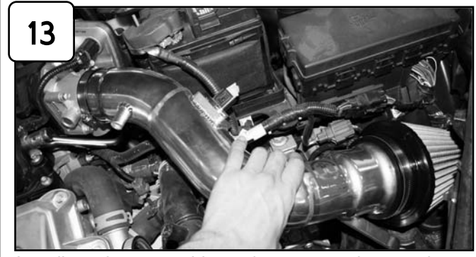
Install intake assembly and position tab to isolation mount. Do not tighten.

For replacement part(s) or "Restore Kit" please log on to takedausa.com P.O. Box 1719 Corona CA, 92878