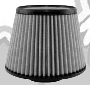
Replacement Filter P/N: TF-9010D