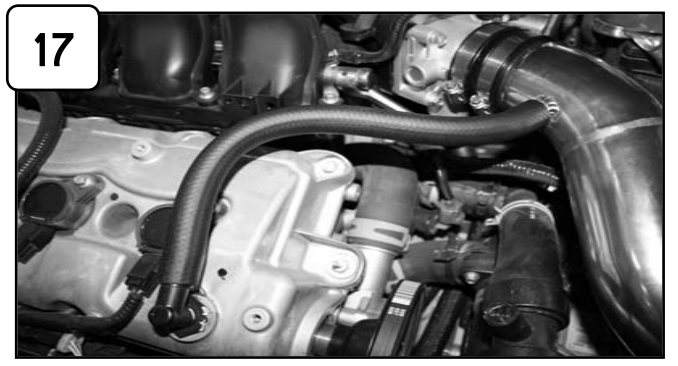
Install provided 5/8" hose to engine and intake tube.