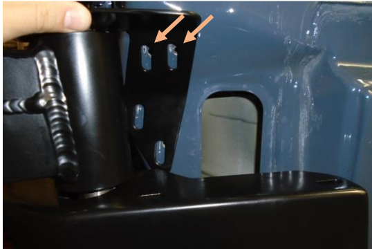
Figure 11: Drilling for Axle Support Bracket

PRO TIP: Use painter's masking tape to protect bumper as swing arm from drill.