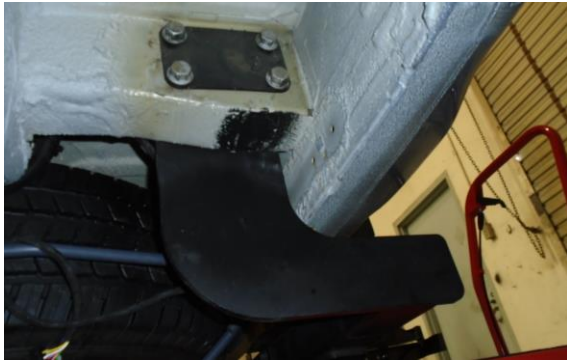
Figure 1: Four (4) of the Hitch Mounting Bolts

PRO TIP: The entire installation is much easier if you lower and remove the spare tire. Then replace once complete or install onto your new bumper.