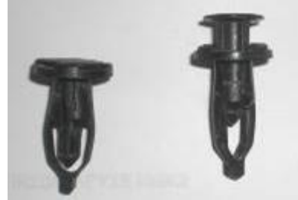
Figure 4: Example of Plastic Rivet