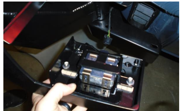
Figure 14: Blind Spot Sensor Installation