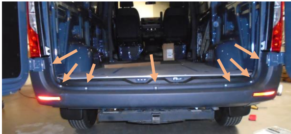
Figure 2: Torx Bolts on the Rear Bumper