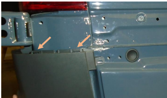
Figure 8: Small Plastic Panel Removed