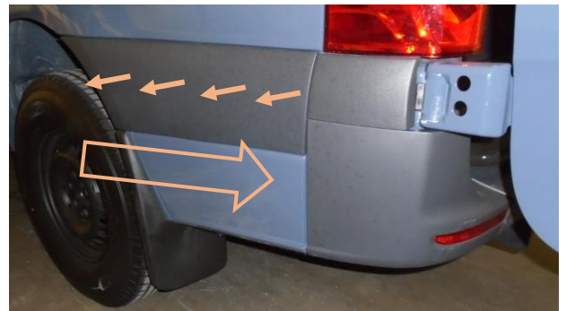
Figure 5: Side Panel Removal