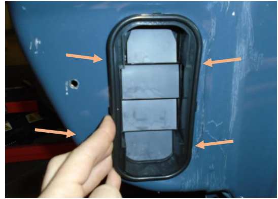
Figure 9: Air Pressure Relief Insert Removal