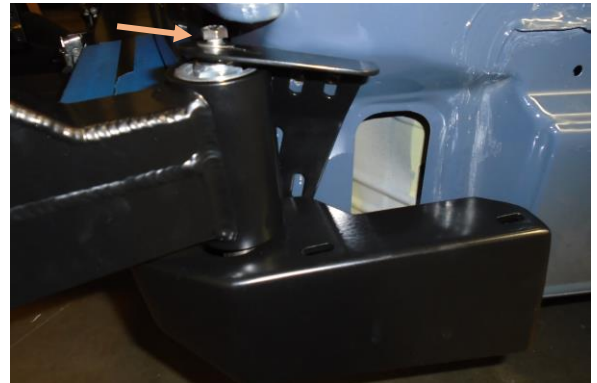
Figure 10: Pre-Mounting Axle Support Brackets