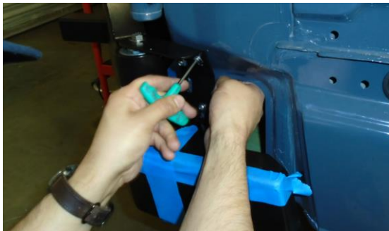
Figure 12: Tightening Hardware Through Insert Opening