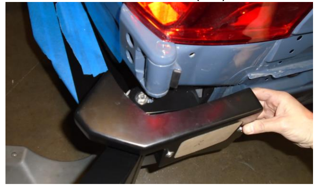
Figure 13: Installation of the Trim Assembly

PRO TIP: Mounting from the vehicle to the hitch and from the hitch to the aluminum bumper are both adjustable. Loosen associated bolts, position, and re-tighten into desired location on vehicle.