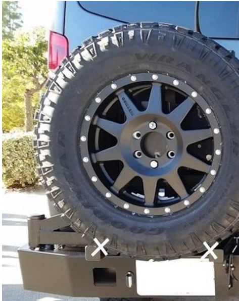
Figure 15: Tire Resting Correctly on Swing Arm