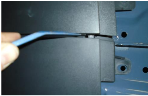
Figure 7: Removing Small Plastic Panel from Rear Bumper