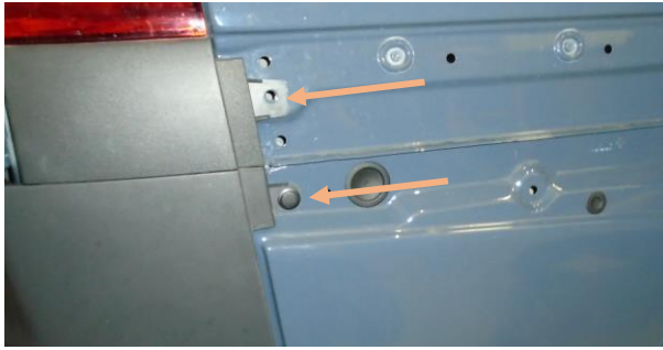
Figure 6: Plastic Rivets Underneath the Side Panel