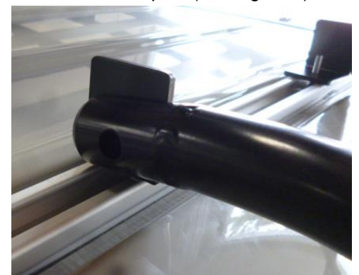
Figure 2: Ladder installed on roof gutter