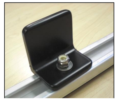
Figure 1: Brackets installed on gutter