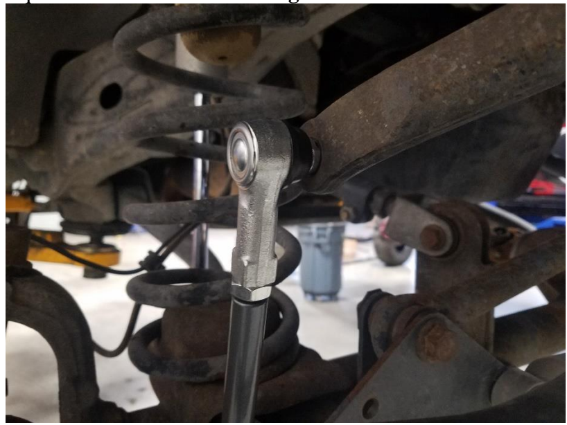
Figure 2. Correct sway bar link rod end orientation.

6. If using the sway bar end links in conjunction with a Synergy Sway Bar Disconnect Kit, remove the sleeve inside the bushing end and slide the bushing end of the sway bar links over the studs. We recommend a light grease, soap or even just water as a lubricant to help the bushings slide on the studs. It may be necessary to raise or lower the axle on one side in order to get the hardware to line up. Make sure the zerk fitting is facing toward the front of the jeep and note that both sway bar links mount on the pass side of the axle mounts. See Figure 3 .