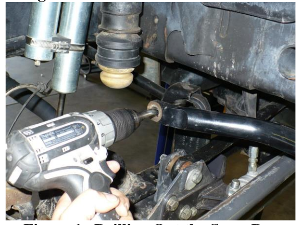
Figure 1. Drilling Out the Sway Bar