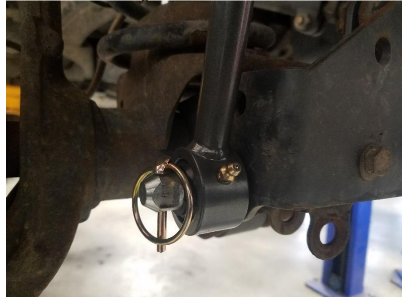
Figure 3. Sway bar bushing end with quick disconnect studs.

6. If using the sway bar end links in conjunction with a Synergy Sway Bar Disconnect Kit, remove the sleeve inside the bushing end and slide the bushing end of the sway bar links over the studs. We recommend a light grease, soap or even just water as a lubricant to help the bushings slide on the studs. It may be necessary to raise or lower the axle on one side in order to get the hardware to line up. Make sure the zerk fitting is facing toward the front of the jeep and note that both sway bar links mount on the pass side of the axle mounts. See Figure 3 .