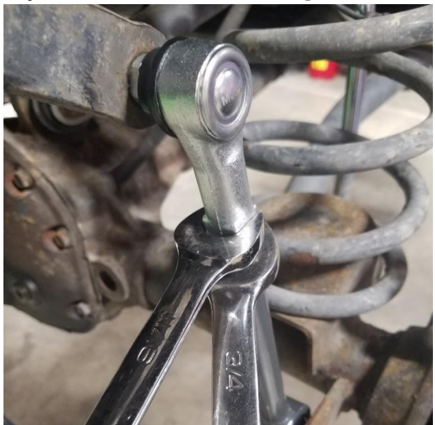
Figure 4. Tightening the tie rod end jam nut.

9. Recheck all hardware after 100 miles of driving and after every trip off road.