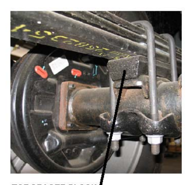
TOP SPACER BLOCK

When installing the 6401 SPACERS, simply loosen the four (4) <u>ubolt</u> nuts, remove the top spacer block, add the four (4) new spacers, re attach the four (4) nuts. Torque to manufacturers specifications. See photos below.