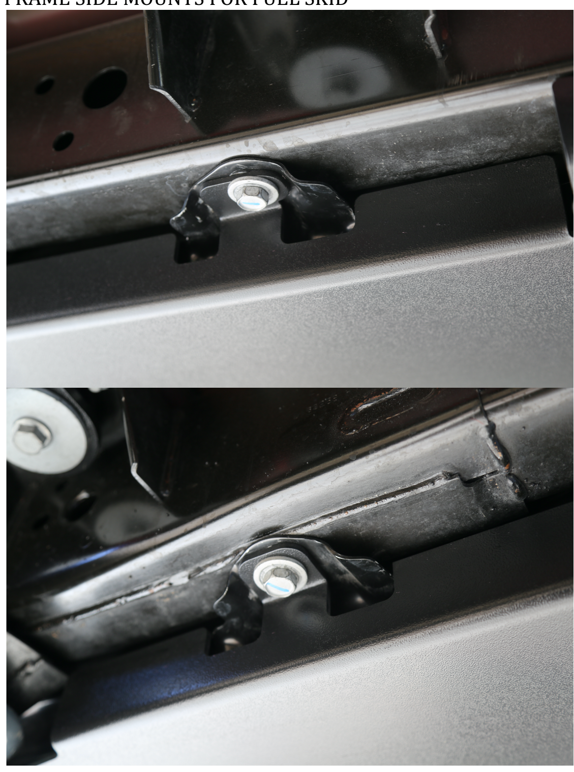
FRAME SIDE MOUNTS FOR FUEL SKID

Customer Service / Tech Support: <a href="mailto:sales@rockhard4x4.com">sales@rockhard4x4.com</a> Thank you for your purchase! Please read all instructions carefully prior to beginning installation of your Rock Hard 4x4 product.