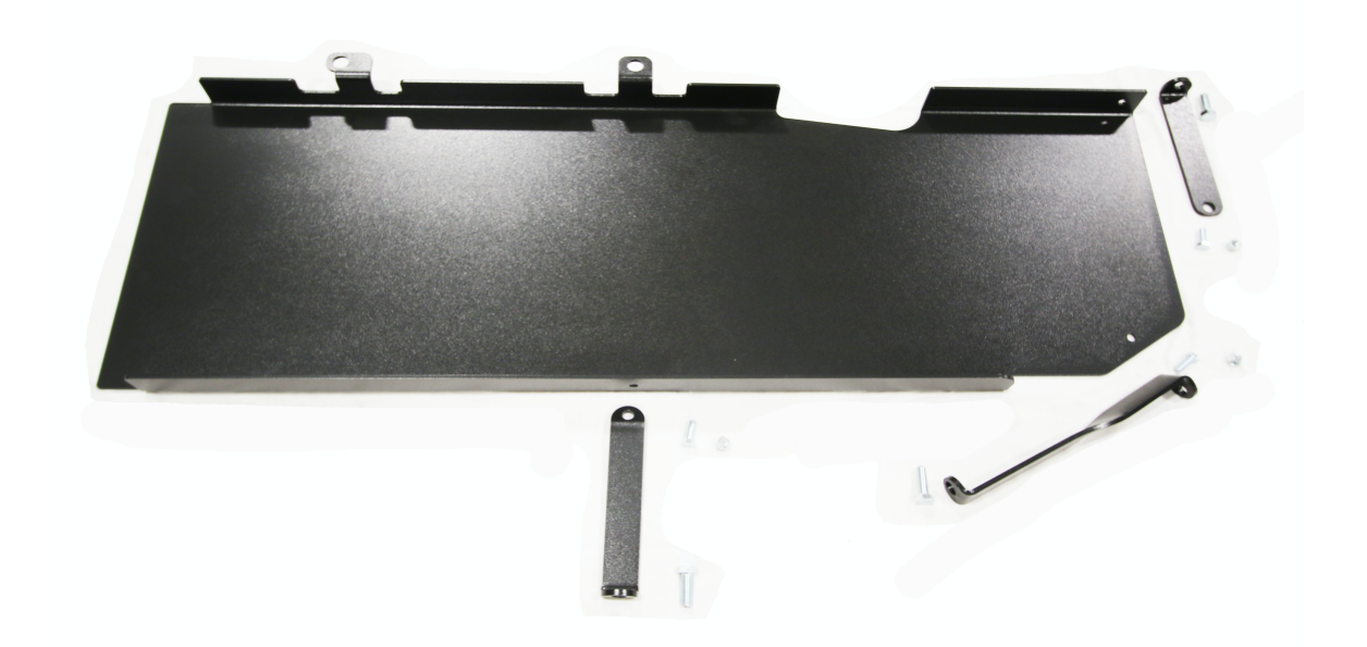
CENTER MOUNT NEAR REAR DRIVESHAFT BOOT

6. Install 3 fuel tank brackets into nuts in undercarriage with 3x 12mm x 1.5 x 35mm bolts. Hang fuel skid to brackets with 3x 3/8 x 1 hex bolts and 3x 3/8 nylock nuts. Remove 2x frame side factory bolts. Slip front of skid between cross member and belly pan skid.