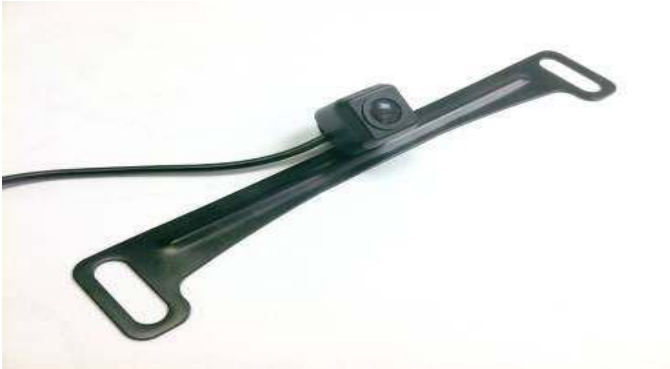
License Plate Bracket

Determine which of the two supplied camera mounting methods you prefer.