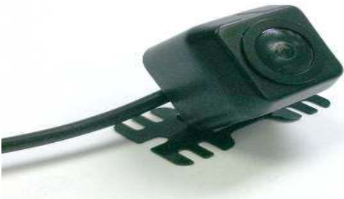
Alternate Camera Mount Bracket

Place camera in desired position to confirm fitment (Note: Some states prohibit items blocking the license plate; check local authorities to confirm legal status for your application).