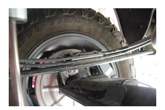
Lower the axle enough to insert the new lift block