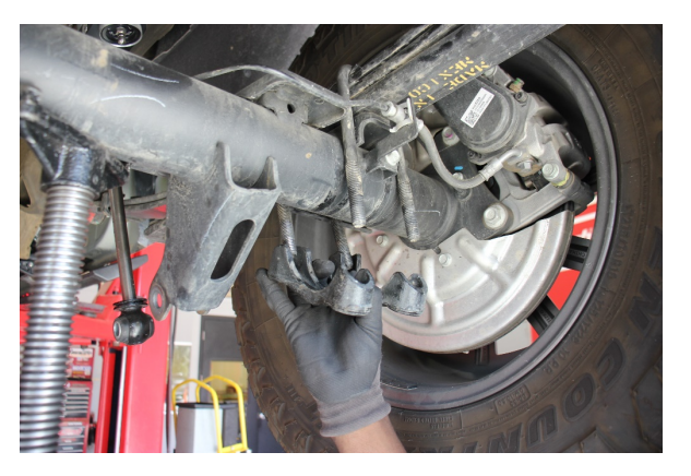
Remove the U bolts and bracket securing the axle to the leaf spring