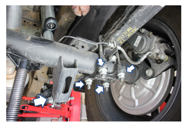
With the vehicle raised and properly supported loosen and remove the hardware securing the lower shock mount and the 4 nuts and U-bolts securing the axle to the leaf spring