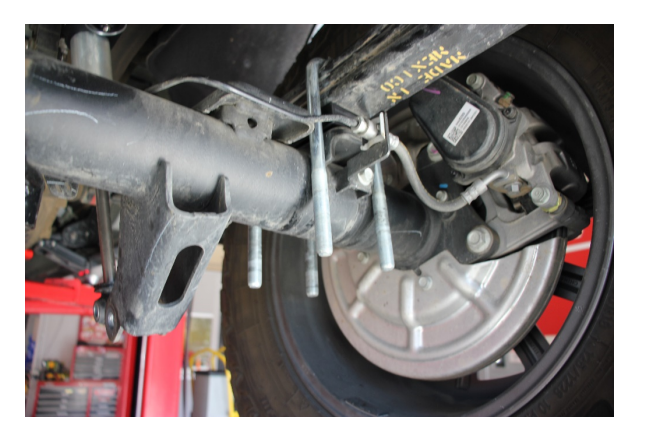
Install the provided U bolts.