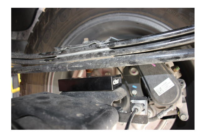
Insert the lift block with the pin pointing down located in the hole on the axle pad