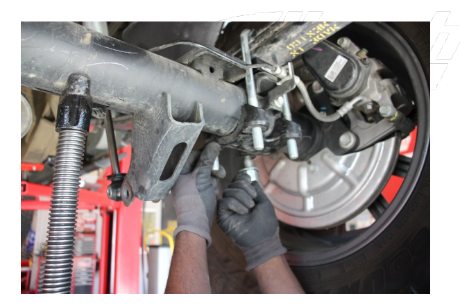
Install the OE axle carrier and the provided washers and nuts and hand tighten so each end is evenly tightened. Do not tighten completely at this point.