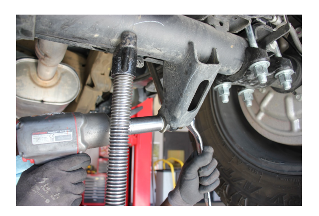
Reinstall the lower shock mount to the shock