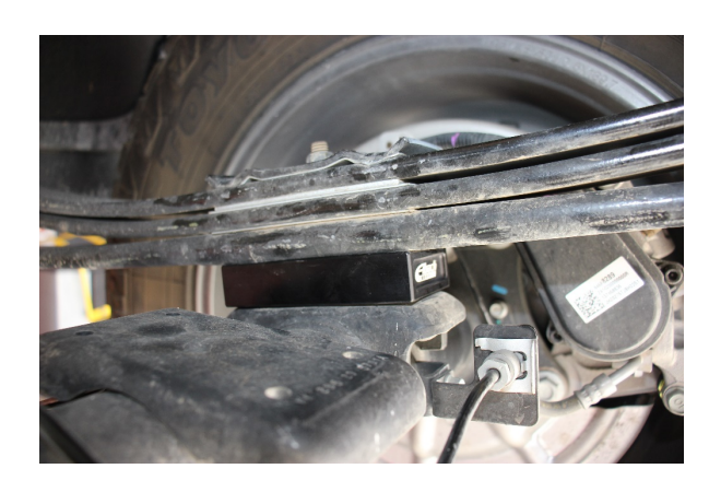
Raise the axle so the locating pin on the bottom of the leaf springs is located in the hole on the top of the lift block