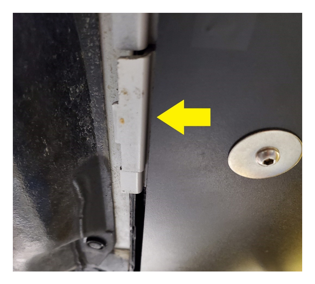
2.5. Holding the side splitter still, mark each slot.

Toyota GR86 Side Splitter – Install Manual