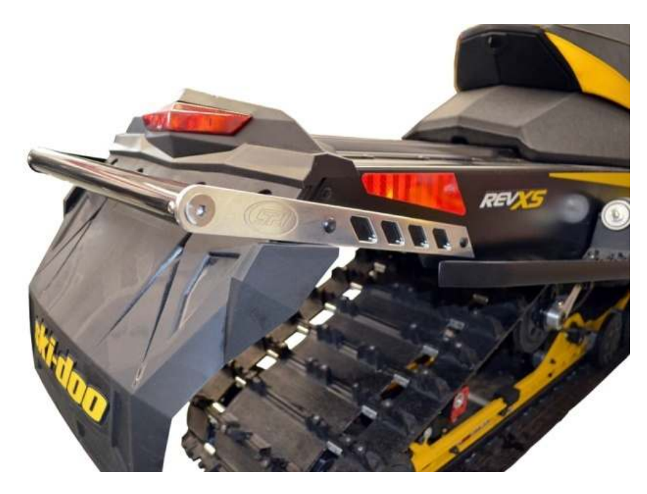
Bumper completely installed and ready to use! Warranty

Be sure the Straightline tunnel braces have no manufacture defects. If the bumper has been installed there are no warranties for fitment.