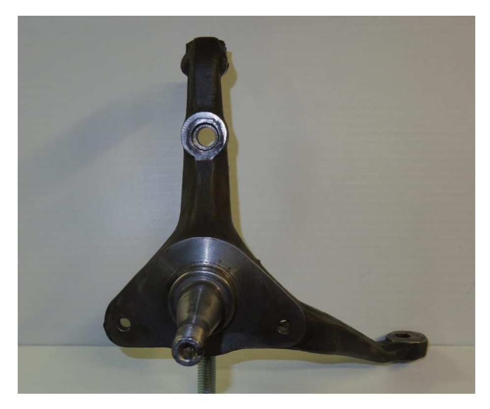
← Front of Car

Applications: 1957-68 Edsel, Ford & Mercury Full Size Cars