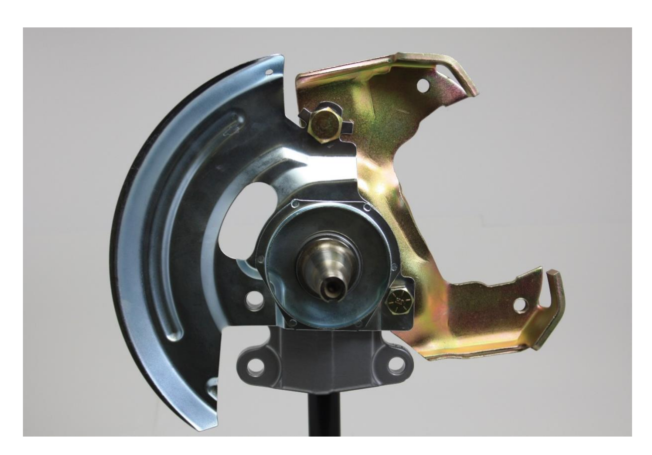
\leftarrow Front Of Car