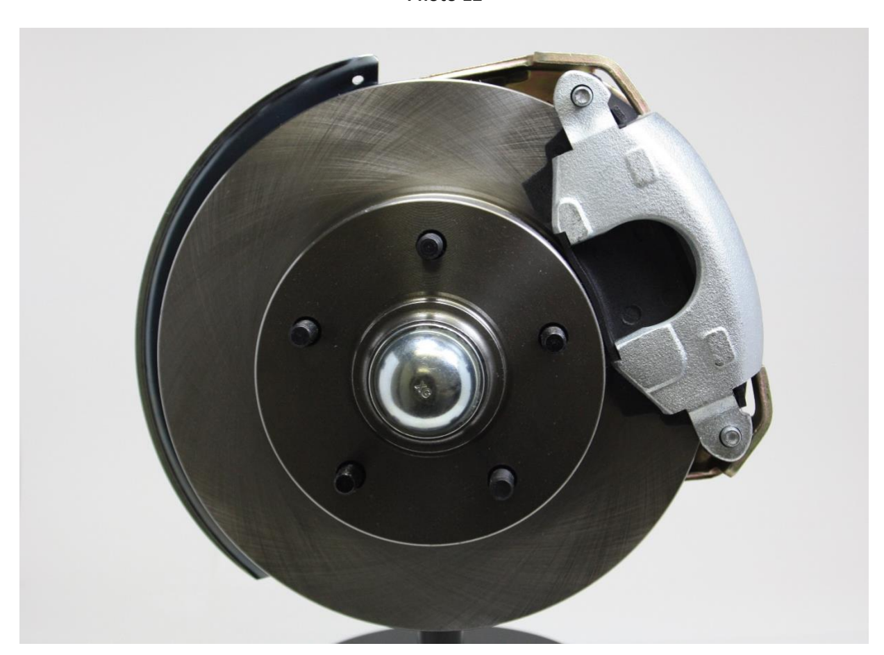
←Front Of Car