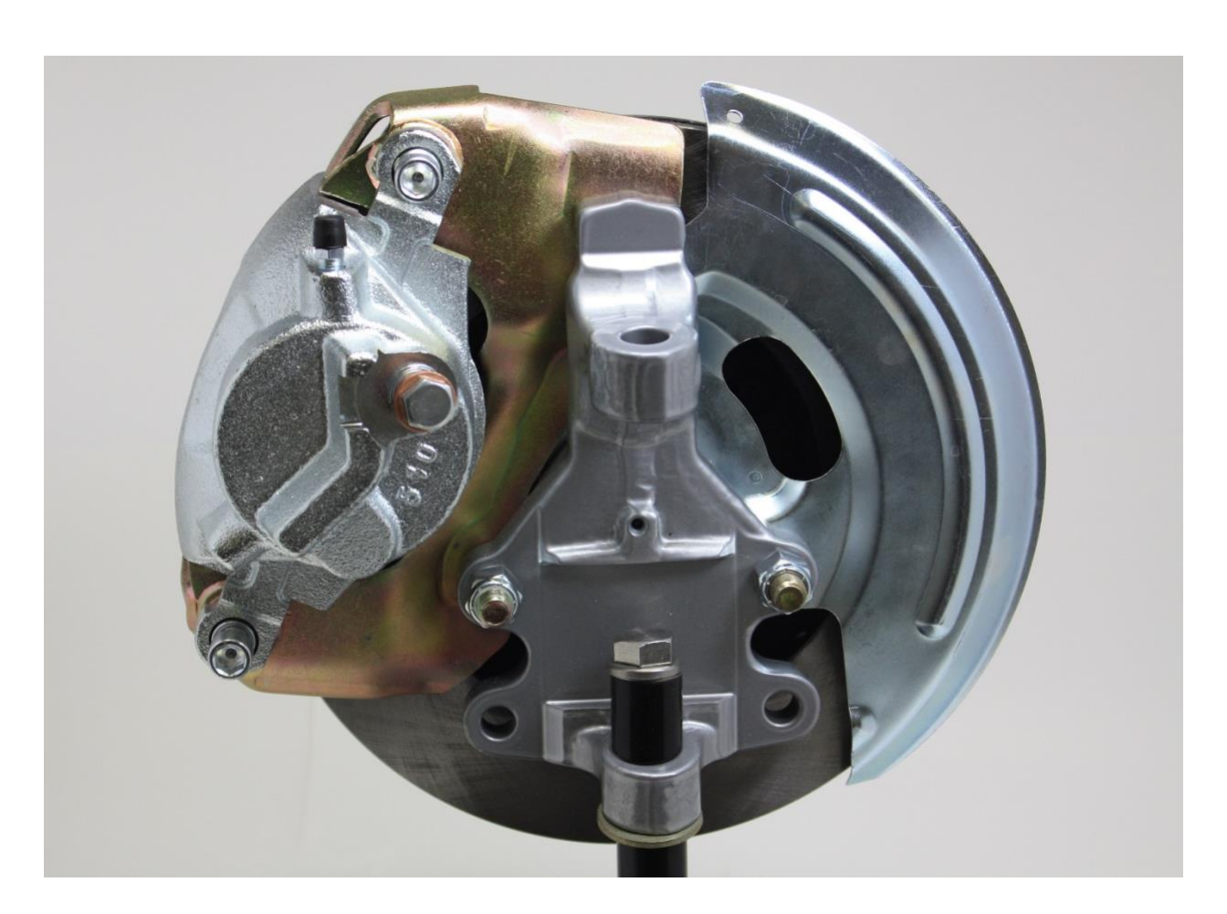
Front Of Car→