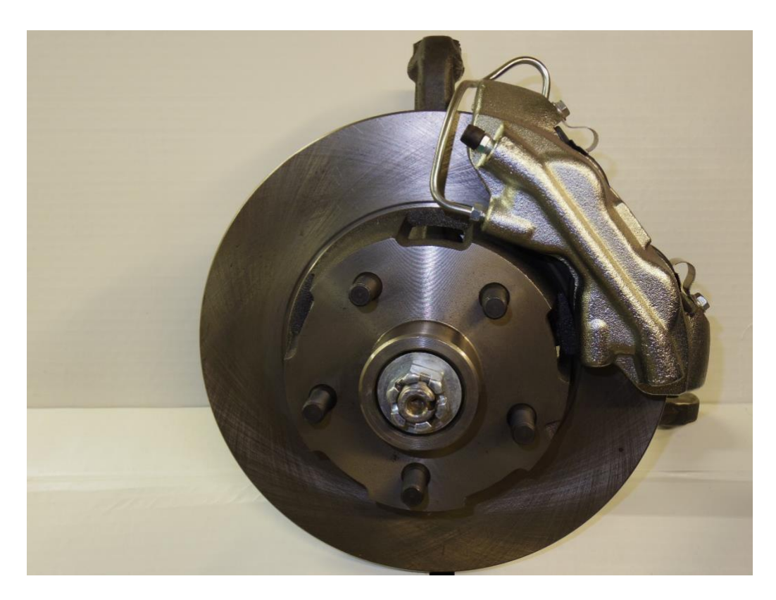
← Front of Car