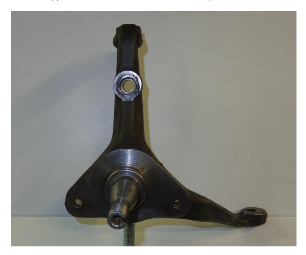
← Front of Car

Applications: 1957-68 Edsel, Ford & Mercury Full Size Cars