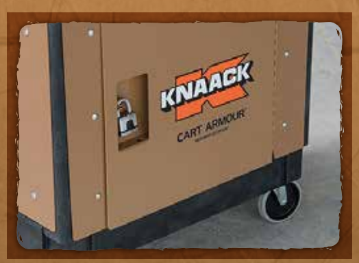
Heavy Duty Construction