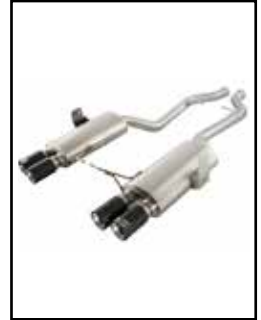
Cat Back Exhaust (E92/93)