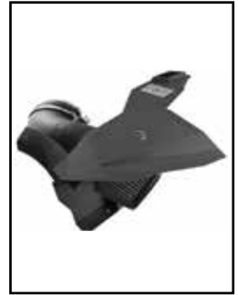
Stage 2 Intake System