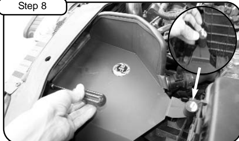
Install trim seal to housing and place into vehicle. Tighten using screws from step 6. Use provided M6 isolation mount to tighten housing down in front of battery.