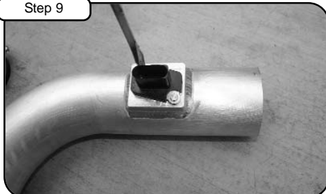
Install MAF sensor into new tube with screws provided and tighten using flat head screwdriver.