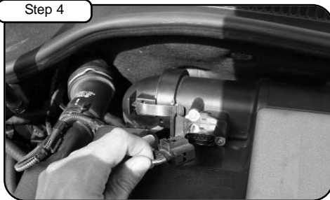
Disconnect the MAF harness and unclip the two clips holding in OE intake tube. Pull away OE tube from engine cover.