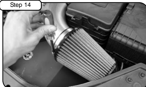
Install Air Filter and tighten using 5/16" nut driver. ( To ensure filter is engaged properly, mark a line 1" from the end of the tube, position filter flange at line and tighten clamp ).