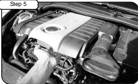
Carefully grab engine cover firmly, pull up and remove. (This may require some force)