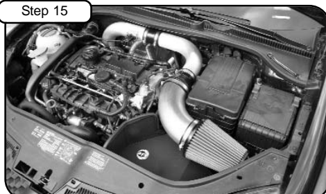
Your installation is now complete. Check all clamps and hoses periodically. Thank you for choosing aFe!