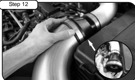
Place 2-3/4" x 4" reducer coupler on 2-3/4" tube side. Place 4" 90 degree tube onto 4" coupler side. Guide tab on 4" tube into isolation mount.