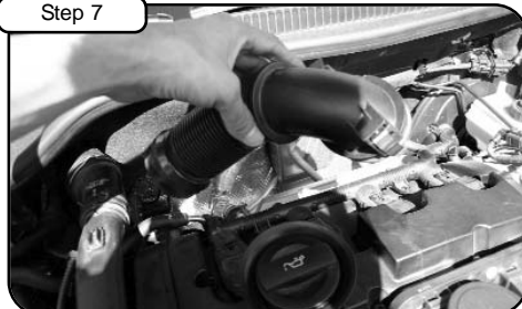
With pliers or channel locks, remove clamp off OE intake tube and remove from turbo. Also make sure OE turbo coupler is removed.