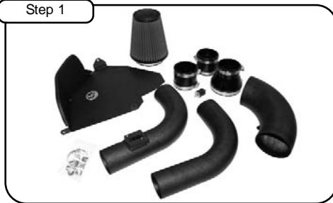
Complete kit with parts.