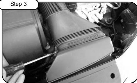
With T-20 torx bit, loosen the 2 bolts that hold in OE intake ram air unit and pull away.