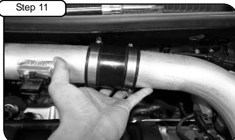
Place 2-3/4" x 3" straight coupler onto other 90 degree tube and install. Do not tighten.