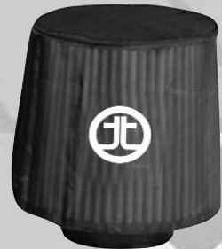
Pre Filter P/N: TP-7011B

Note: Filter Cleaning: When cleaning your Pro Dry S™ filter, be sure to use only "Restore Kit" (Takeda P/N: TP-7015C Pro Dry S™ cleaner only.)