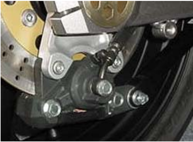
c. OEM at the rear caliper