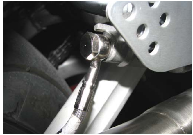
b. Galfer at the rear master cylinder