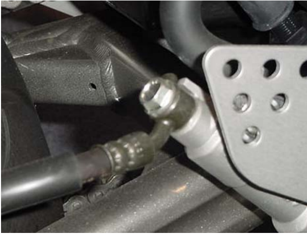
a. OEM at the rear master cylinder