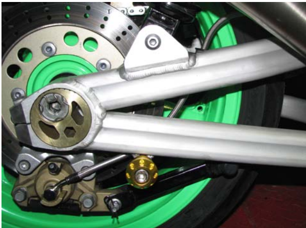
e. Rear overall