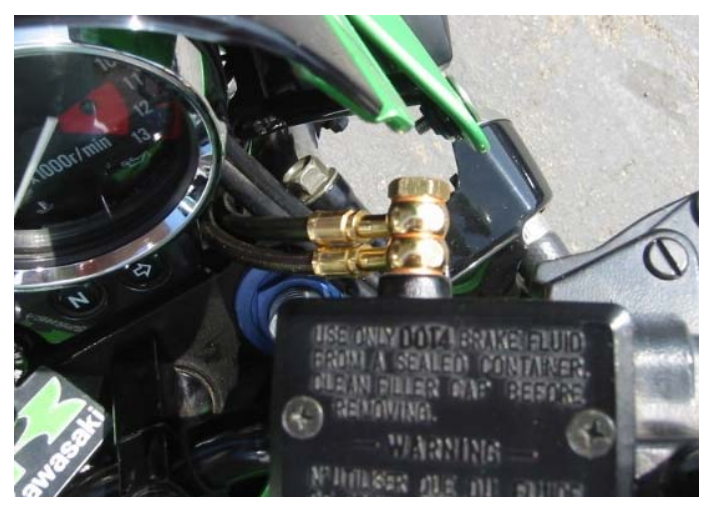
a. Front master cylinder

Please be aware that the overall braking feel has been changed dramatically. We suggest taking it easy while you get used to the new brake lever pressure and feel. We recommend checking your brake system periodically; be sure to check that your bolts are tight and VERY carefully check your lines for any leaks or damage. If there are any signs of damage or stress to the lines, the complete brake line kit will need to be replaced. Remember, our brake lines have a LIFETIME WARRANTY! If you have any problems or questions, do not hesitate to call our tech department - (800) 685-6633 .