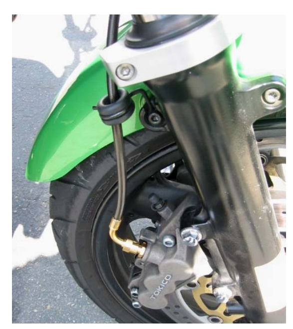
b. Right caliper