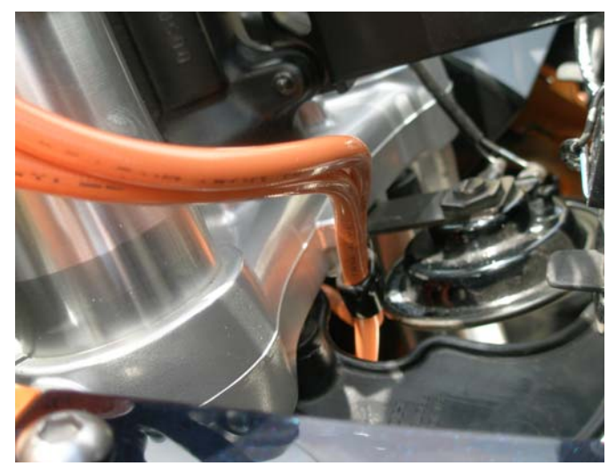
c. Routing at lower triple tree