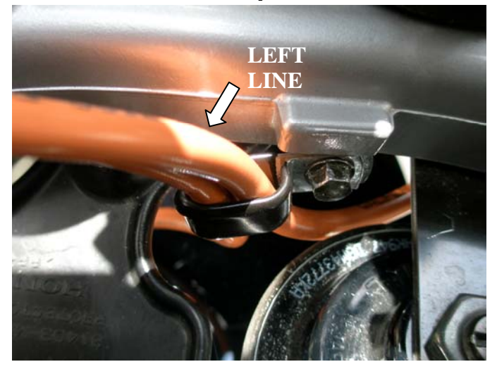
d. Galfer provided c-clip at lower triple tree

GALFER USA 310 IRVING DRIVE OXNARD, CA 93030 . PH (805) 988-2900 . FAX (800) 685-6633 WWW.GALFERUSA.COM