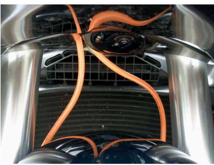
e. Routing behind forks