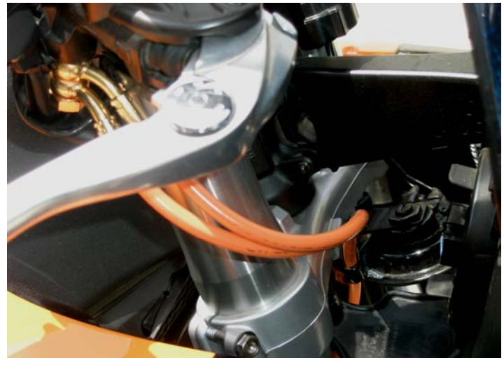
b. Routing from master cylinder to lower triple tree