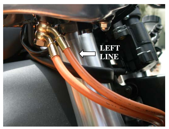
a. Front master cylinder

Please be aware that the overall braking feel has been changed dramatically. We suggest taking it easy while you get used to the new brake lever pressure and feel. We recommend checking your brake system periodically as well as before and after every race ; be sure to check that your bolts are tight and VERY carefully check your lines for any leaks or damage. If there are any signs of damage or stress to the lines, the complete brake line kit will need to be replaced. Remember, our brake lines have a LIFETIME WARRANTY! If you have any problems or questions, do not hesitate to call our tech department - (800) 685-6633 .