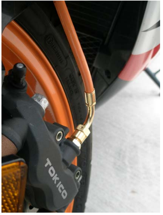
h. Left caliper, notice position of fitting

GALFER USA 310 IRVING DRIVE OXNARD, CA 93030 PH (805) 988-2900 . FAX (800) 685-6633 WWW.GALFERUSA.COM