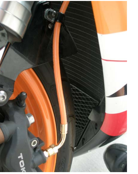
g. Right caliper, notice Galfer provided c-clip at fender