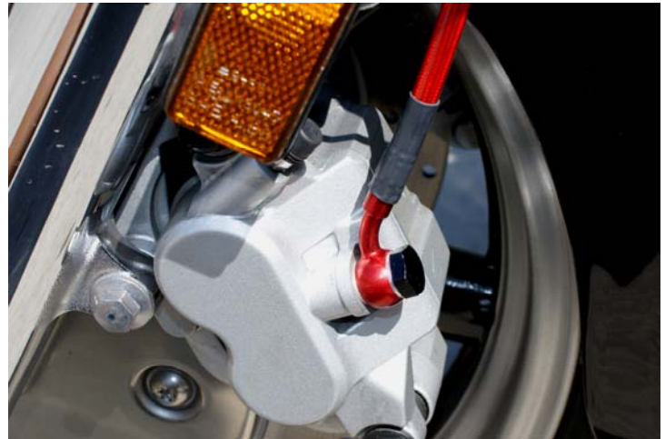
d. Left caliper

GALFER USA 310 IRVING DRIVE OXNARD, CA 93030 PH (805) 988-2900 . FAX (800) 685-6633 WWW.GALFERUSA.COM