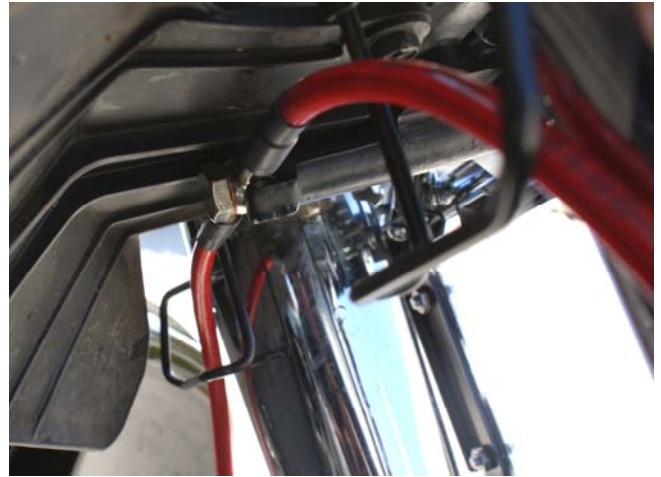
b. 2-line assembly and prop valve