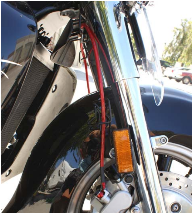
c. Right caliper