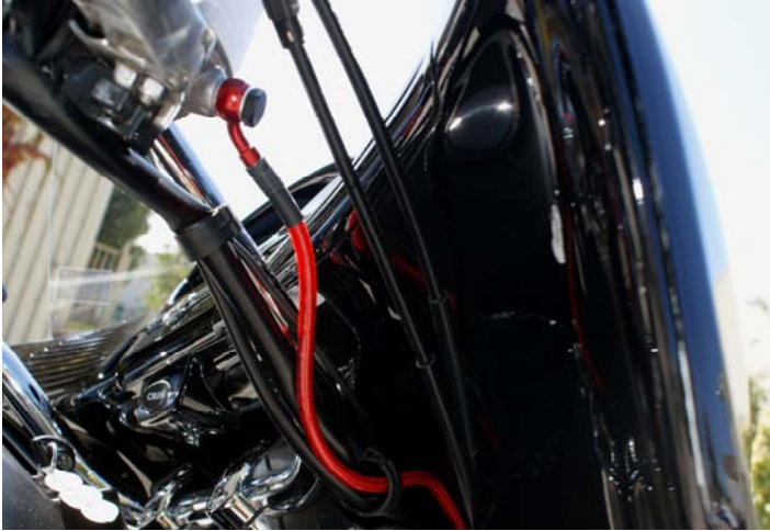
a. Front master cylinder

Please be aware that the overall braking feel has been changed dramatically. We suggest taking it easy while you get used to the new brake lever pressure and feel. We recommend checking your brake system periodically; be sure to check that your bolts are tight and VERY carefully check your lines for any leaks or damage. If there are any signs of damage or stress to the lines, the complete brake line kit will need to be replaced. Remember, our brake lines have a LIFETIME WARRANTY! If you have any problems or questions, do not hesitate to call our tech department - (800) 685-6633 .