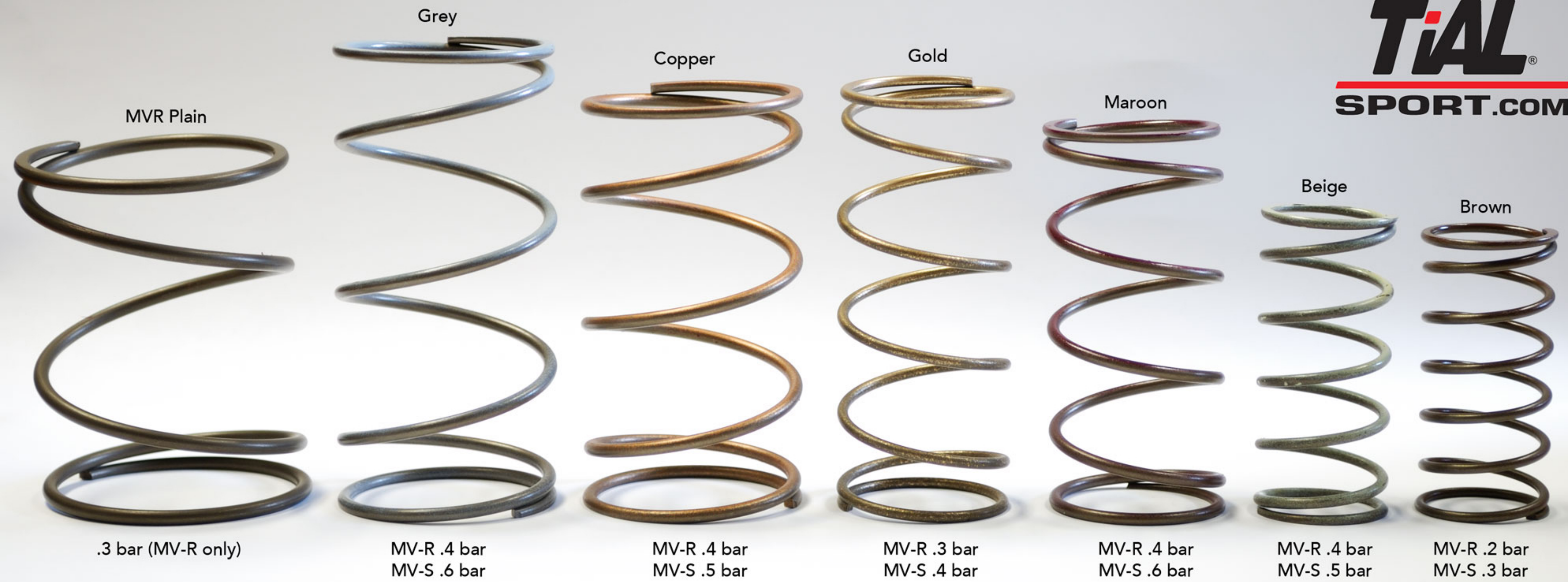
TiAL MV-S and MV-R Spring Color Chart

*Spring pressures are calculated on a 1:1 back pressure rating, it is not uncommon to see a +/-2psi differential.