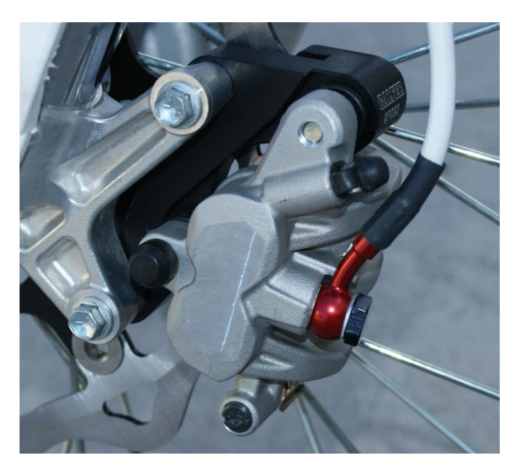
D. Caliper with optional Galfer Oversize relocation bracket