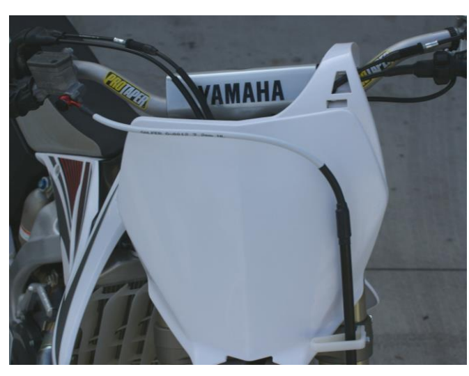
B. Number Plate/ Stock Line Holder