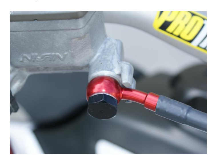
A. Master Cylinder

get used to the new brake lever pressure and feel. We recommend checking your brake system periodically; be sure to check that your bolts are tight and VERY carefully check your lines for any leaks or damage. If there are any signs of damage or stress to the lines, the complete brake line kit will need to be replaced. Remember, our brake lines have a LIFETIME WARRANTY! If you have any problems or questions, do not hesitate to call our tech department - (800) 685-6633.