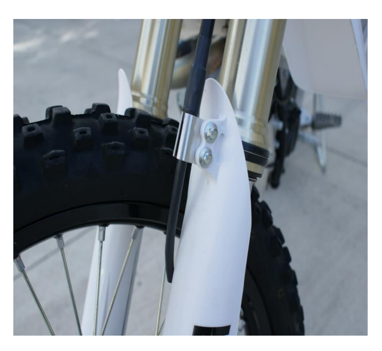
C. Stock Line Holder at Fork