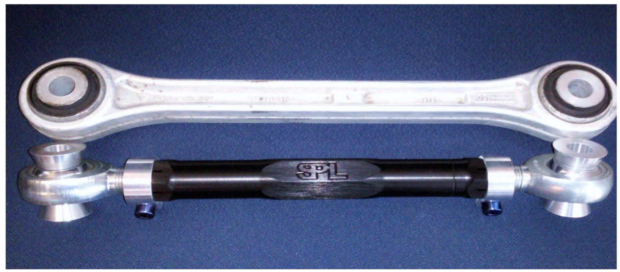
Try to match length of new link to that of old, center to center of the bores.