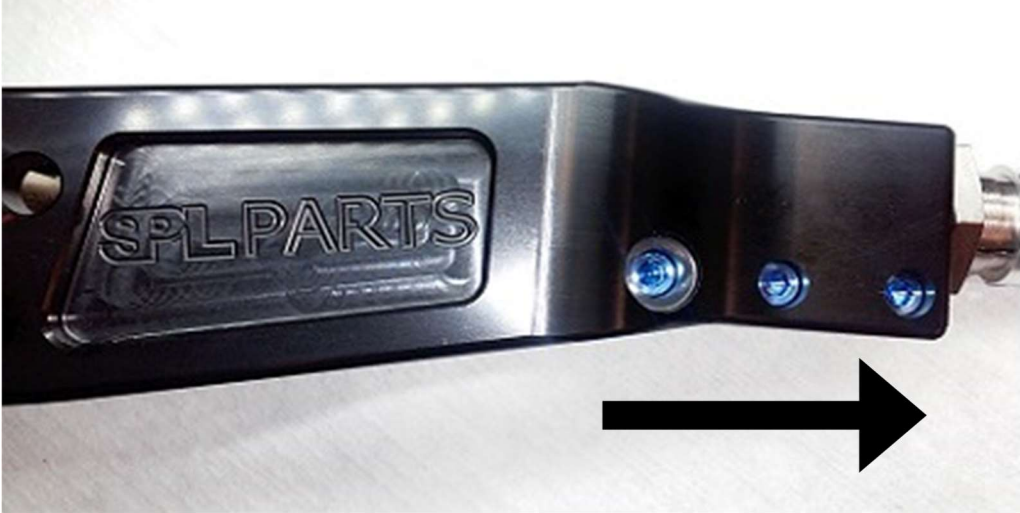
Tighten Blue Anodized Titanium Head Cap Screws starting from the "SPL Parts" logo, working towards the FK Rod End