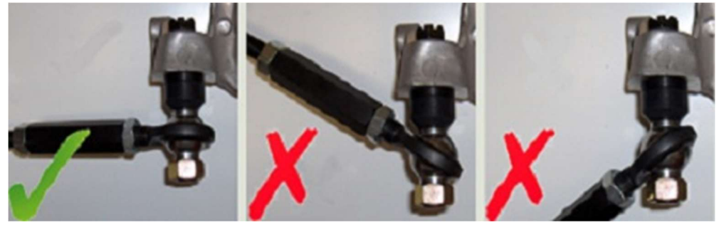
3. Tighten down the 5/8-18 Jam Nut (9) on each end of the Tie Rod End.

There are four Spacers in the kit: 1/8 in (3), two ¼ in (4), and ½ in (5). Use any number or combination of them to achieve the proper bumpsteer setting for your car. Verify there are no clearance issues with the knuckle, subframe, or other suspension arms before putting the car back on the ground. Make sure that the inner tie rod end can articulate freely. The picture below is for illustration purposes only, but it shows proper and improper static position of the rod end bearing. Next, tighten the 5/8-18 Locknut (7) on the bottom of the Tie Rod End Stud to 80 ft-lbs. This will take some effort as it is a crimping locknut.