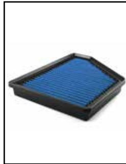
Direct Fit Air Filter