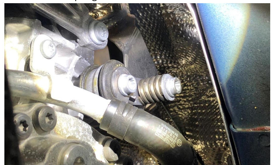
Using a 10mm triple-square, remove the hardware from the spring-loaded exhaust bracket.