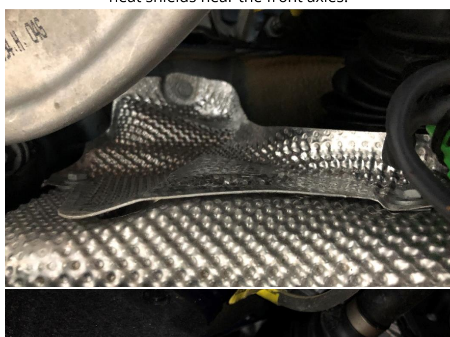
Using a 10mm socket, remove the hardware securing the heat shields near the front axles.