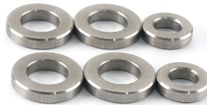
For 2012+ R35 (DBA/EBA)