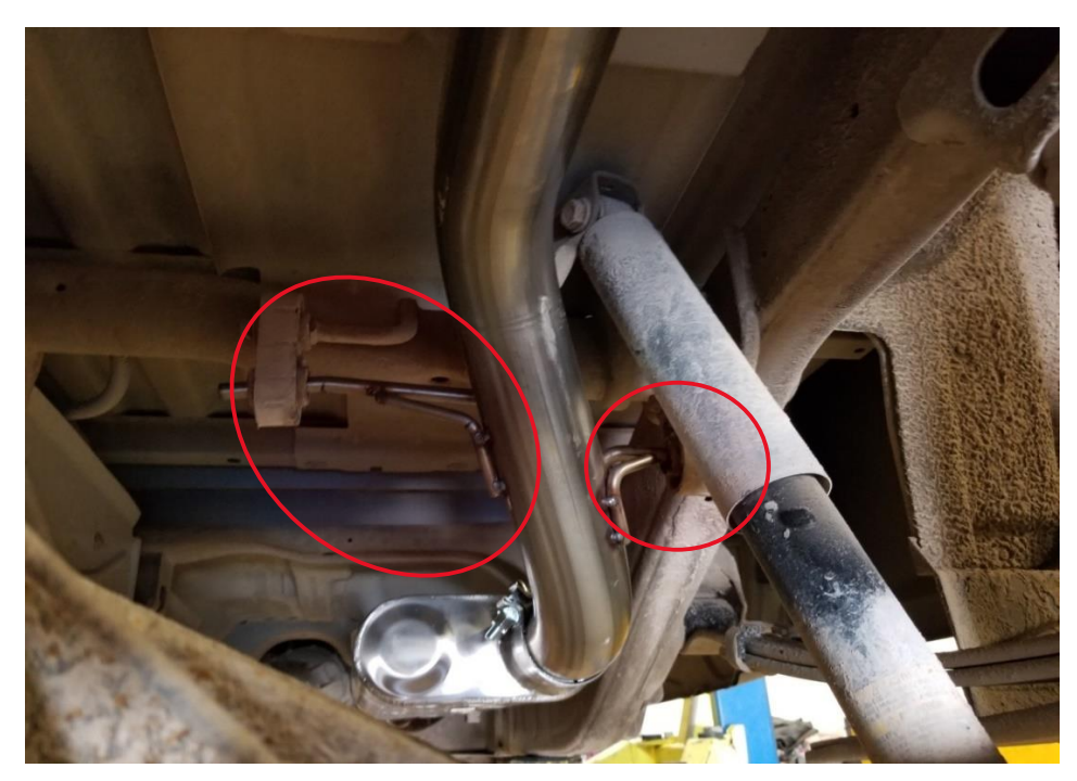
Figure 3 – Before Axle Tube

For the ToughTruck System install the muffler delete tube included with the kit onto the flare tube outlet with clamp. Make sure to tighten clamps until they are snug NOT tight.