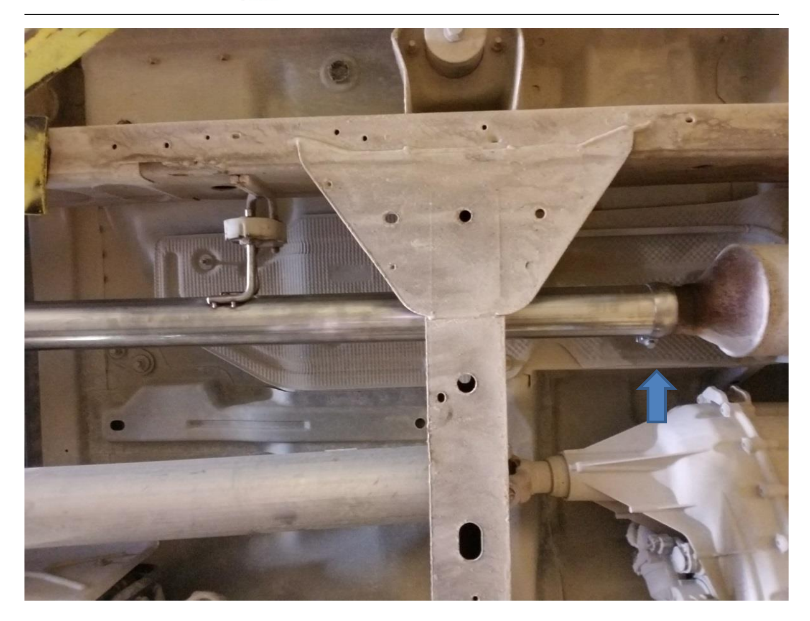
Stock System Removal

Step 1 – Unclamp factory exhaust at (figure 1).