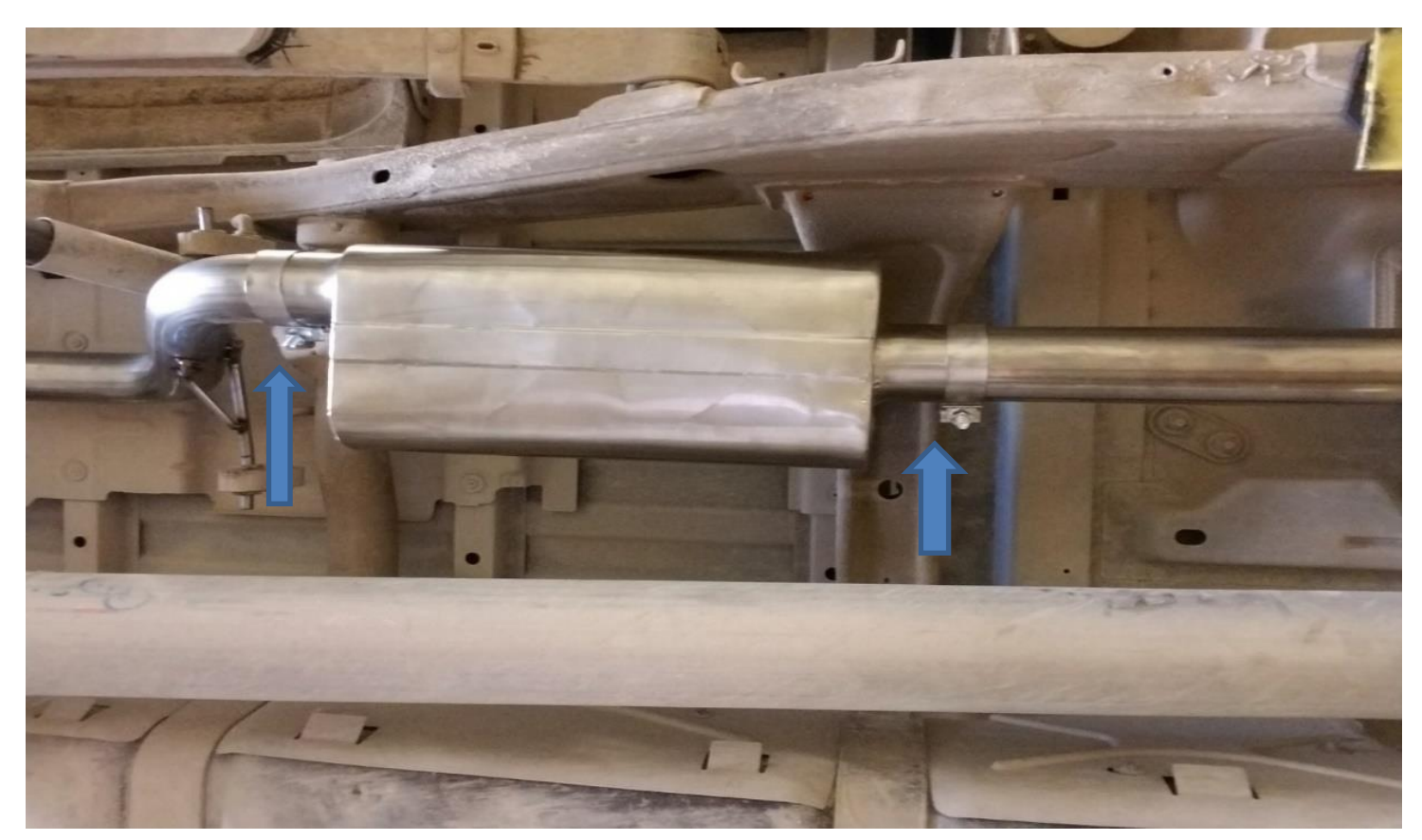
(Figure 2) Muffler orientation