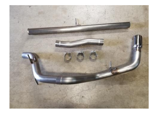
Part # 92T105