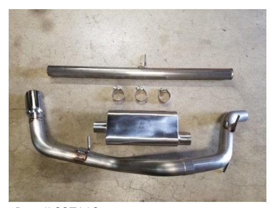
Part # 92T110 Part No. 92T110