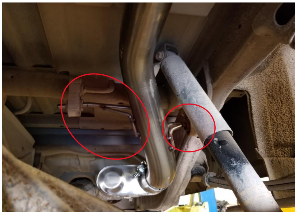
Figure 3 – Before Axle Tube

For the ToughTruck System install the muffler delete tube included with the kit onto the flare tube outlet with clamp. Make sure to tighten clamps until they are snug NOT tight.