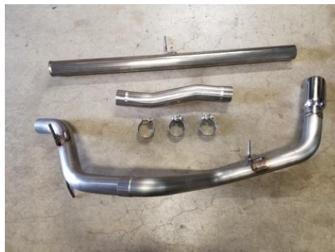
Part # 92T105