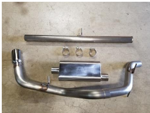
Part # 92T110