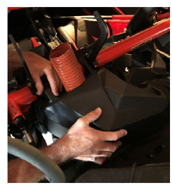
STEP 5. Install Particle Separator (1) onto the Metal Brackets (5) on the left and right-side using Screw (6) and Washer (4) and a 3/16" allan wrench to tighten. Washer MUST be between the Metal Bracket (5) and Particle Separator (1). If the washer is placed under the head of the Screw (6) the Particle Separator will rotate freely and may cause damage.