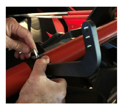
STEP 3. After Roll Bar Clamps (1) are installed, measure gap between the Metal Brackets (5) and set at 9.5 inches and tighten bolt. Insert the Duct Adapter (8) inside the vehicles air intake prefilter. Then install the vehicle air intake prefilter back into the vehicle. Place a Hose Clamp (2) over the Flexible Hose Duct (9) and insert onto the Duct Adapter (8) and tighten with Philips screwdriver.