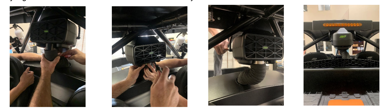
KWT Filters - www.kwtfilters.com

STEP 7. If necessary, cut excess off the Duct hose (9) with wire cutters for better fit. Insert a Hose Clamp (2) over one end of the Duct hose (9) and place over the Duct Adapter (8) and tighten. Insert a Hose Clamp (2) and the other end of the Duct hose (9) and place over the Particle Separator (1) intake and tighten with a Philips screwdriver, then fully Tighten screws on Metal brackets with 3/16" Hex Key.