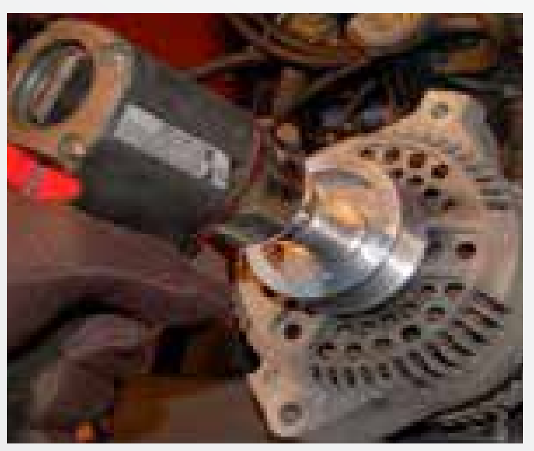
Remove the alternator mounting bolts, lift the alternator out of its cradle to access the pulley. Using an impact, remove the stock pulley and install the BBK Pulley. Re-use the stock nut and/or washer.