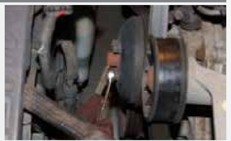
Loosen the bolts on the water pump and crank pulleys.