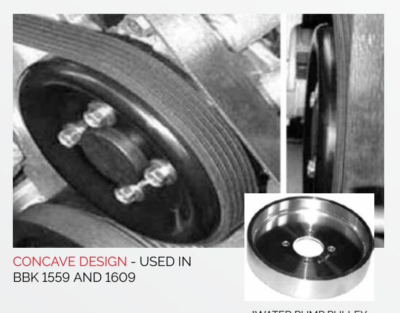
*WATER PUMP PULLEY # MAS178 (APPROX 2001 1/2 - 2004)