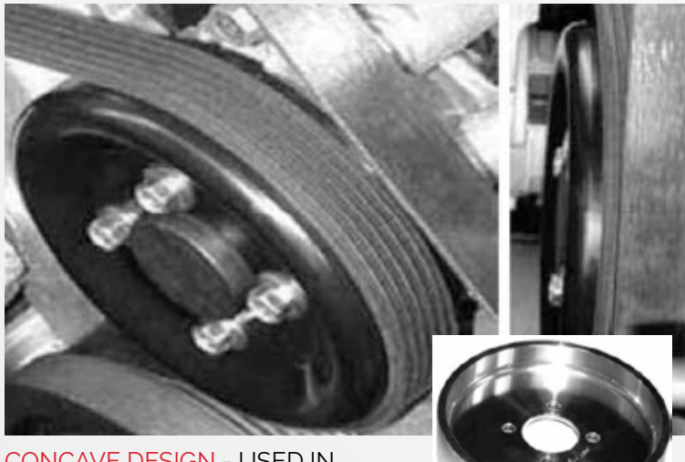
CONCAVE DESIGN - USED IN BBK 1559 AND 1609

*WATER PUMP PULLEY # MAS176 (APPROX 1996 - 2001)