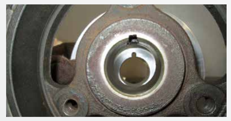
Install the hub of the factory harmonic balancer pulley into the counter bore of the BBK Pulley. Align the threaded hole in each pulley together. Install and hand tighten the (3) \frac{1}{4} \times 1-\frac{1}{4} " bolts. The factory pulley does not completely sit into the under-drive at this point. Carefully tighten the (3) bolts equally in small increments to draw the (2) pulleys together. Remove the (3) \frac{1}{4} " bolts.