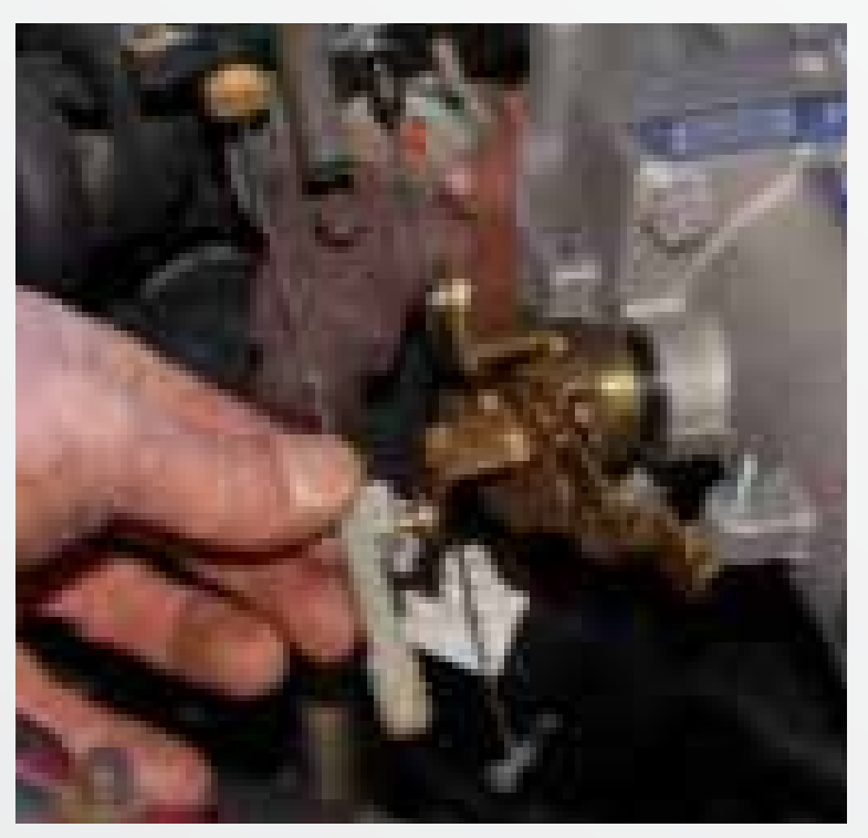
Re-install the throttle cables and return spring.